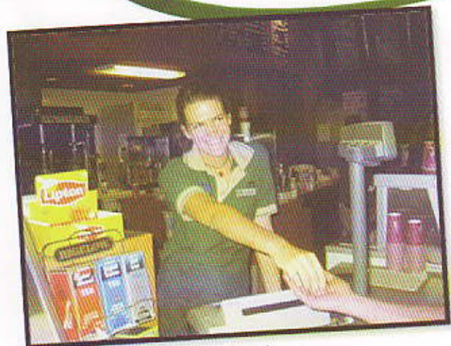
at work in Yosemite