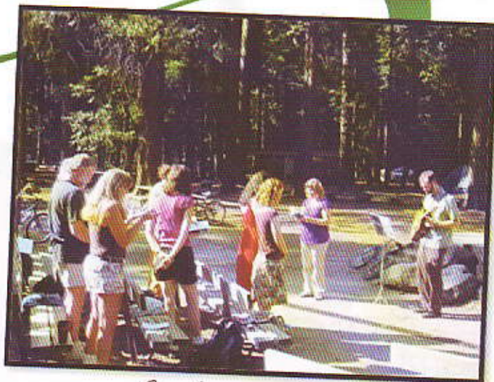
Sunday worship in Yosemite